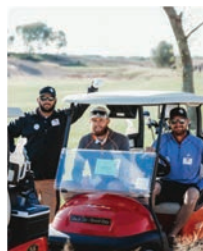
Golf Classic Participants 2018