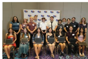
2025 Scholarship Recipients

Boys & Girls Club..... $417,000 Scholarships..... $500,500 Endowment..... $120,000 Youth Community Grants..... $218,450 Pinal County Jr. Livestock Auction..... $197,000 Arizona State FFA Foundation..... $75,000